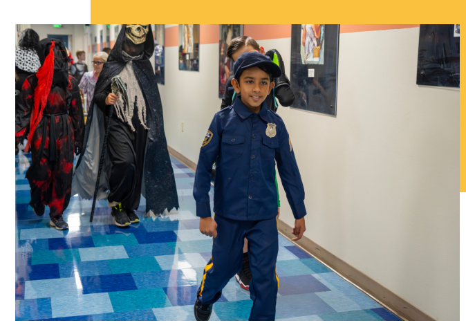
Loved seeing all the creative costumes at our parade