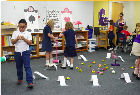
3rd Grade CET