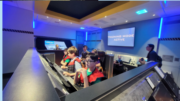
SPACE CENTER WITH 6TH GRADE